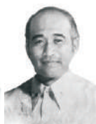
Roman Solitaria 1971-1972