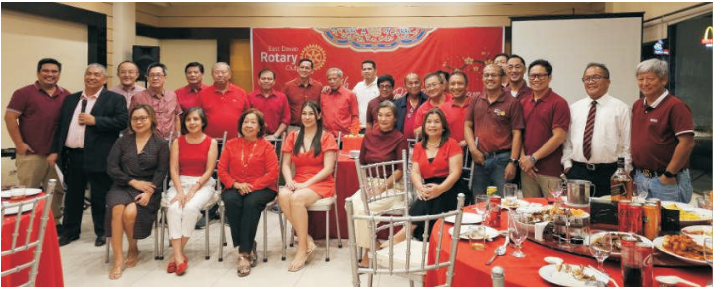
RCED celebrates its 59th Charter Day Anniversary